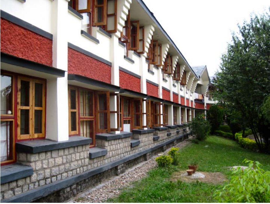
(Nuns' housing at Dolma Ling)