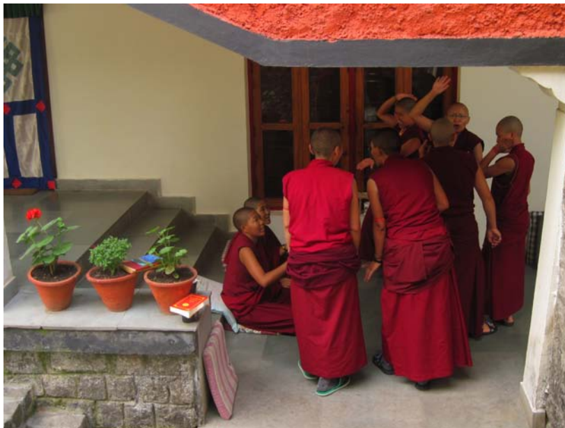
(Nuns getting enthusiastic while practicing debate)

The culmination of these daily practices comes during the annual Jang Gönchoe inter-nunnery debate. The event is so named for Jang, the region in Tibet west of Lhasa where the month long inter-monastery debate originated, and Gönchoe, which is Tibetan