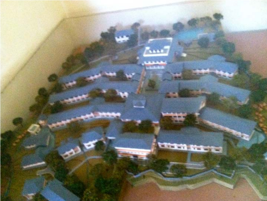
(Small-scale model of Dolma Ling Nunnery grounds)