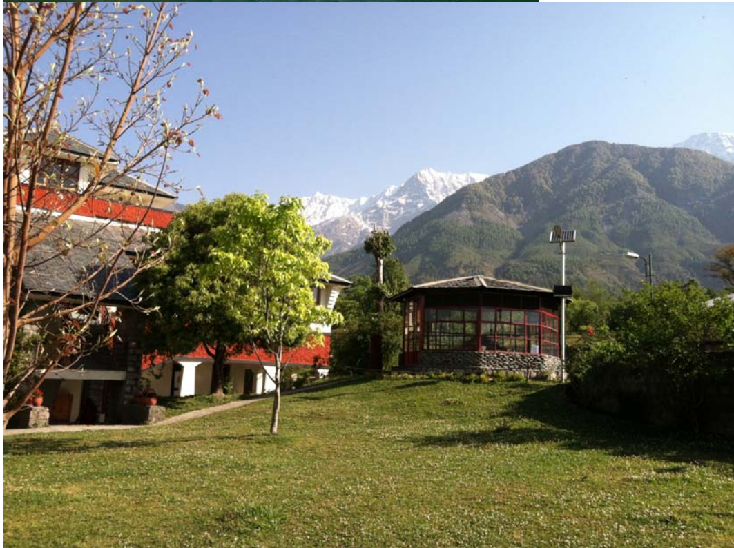
(Butter lamp house and surrounding snow mountains at Dolma Ling)

Located on the outskirts of Dharamsala near Norbulingka Institute, Dolma Ling is a non-denominational nunnery open to women of any Buddhist tradition to come pursue higher education in philosophical texts and dialectics, as well as other nonspiritual subjects. The institute offers classes in both Tibetan and English languages, mathematics, science, and computer technology. This curriculum is progressive and unique among nunneries because it gives nuns who choose not to pursue high degrees in Buddhist philosophy the opportunity to contribute knowledge or services to their surrounding communities. Those nuns who are not interested in studying the