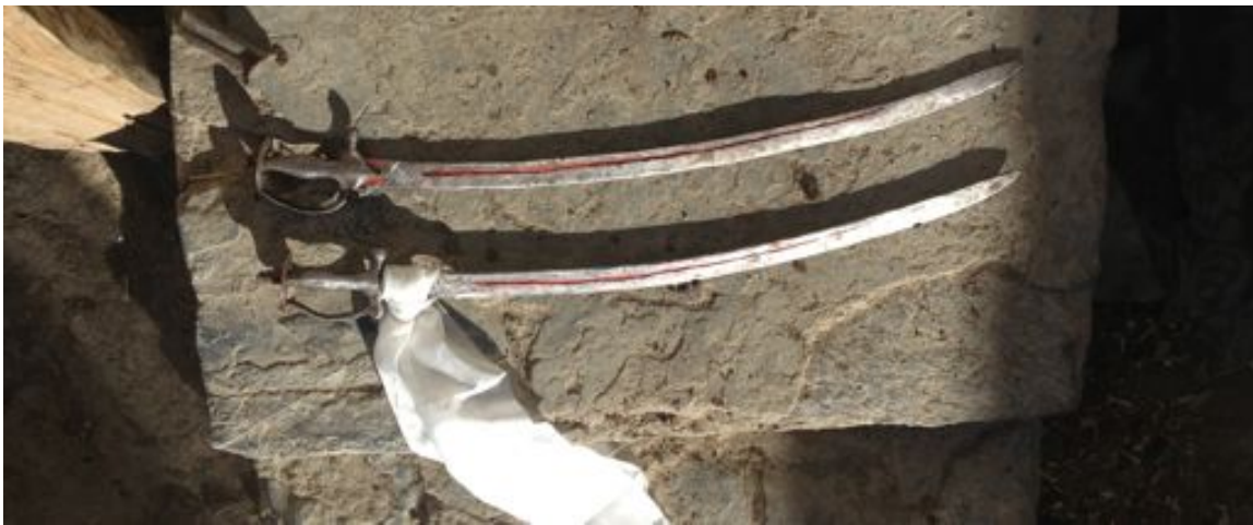
Swords made by Kunzangpa, the Bhar blacksmith.

implements include dyu , small, diamond pieces of iron that are stuck to the bottom of small prayer flag poles that llamas use during pugas . These come in sets of four, designed to be put on blue, green, white, and yellow flags. The katumka , or trident, has many uses. The one I watched Chhering fashion is used for pinning blue, green, white, and red prayer flags to peoples' doors. He fashions the katumka by shaping two pieces, one a stylized U shape, the other a long shaft, pointed and round at one end and flat and stylized at the other. He connects these two pieces with a ript , a small, factory made pin, that he fits through holes punched in the two pieces with a small zong , and then uses a lakdo to expand the pin to fill up the hole. The pin only has one head, and is not heated – it seems like the pieces should easily separate, but they are actually held quite firmly together by the expansion of the ript . Blacksmiths also make smaller ones that are used to pierce the cheeks of the buchen during their ceremonies, as well as during protector deity visitation of local oracles. All of these items are in little demand these days.