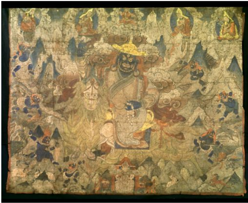
18 th Century Image of rDorje Legpa . 28

Damchen , according to the stories of the elders of Chikem, is an incredibly strong protector deity, a supreme power among all the deities of Tibet. This is not inflation due to local pride – rDo rje Legs pa is an extremely powerful and violent deity. Not only is he a member of the " gter gyi srung ma sde bzhi , 'the four orders of treasure guards,'" who guard the Ningmapa Terma treasure system, protecting the golden treasures of the South, he is a powerful dharma protector for both the Ningmapa and Kagupa lineages. 27 Spiti teachings on Damchen focus on his great strength and power.