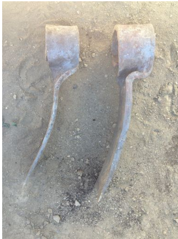
Side view of two tokzes. The left is made from an automobile suspension system, the right from electrical infrastructure.