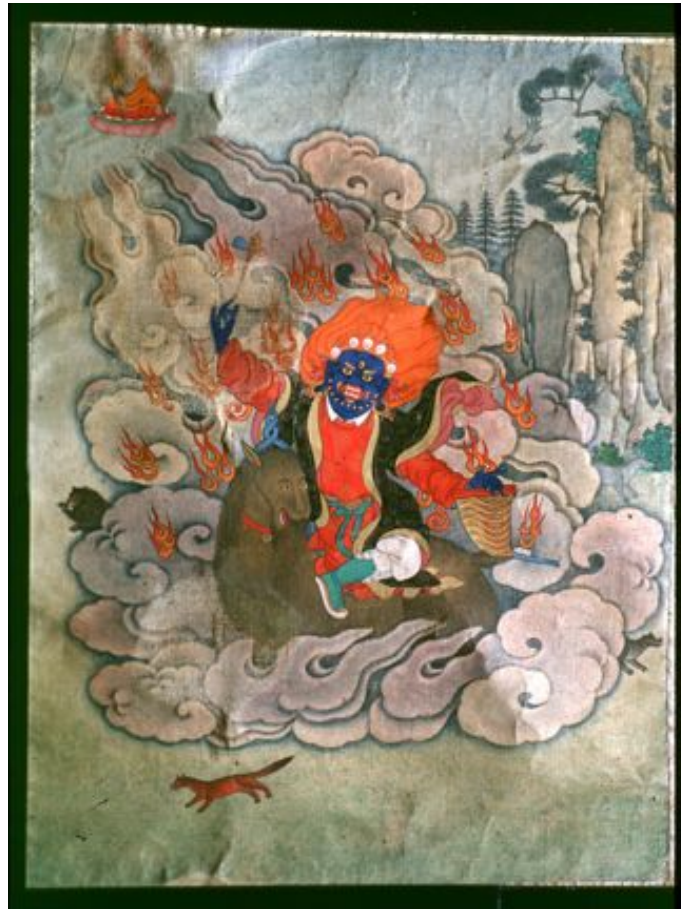
18 th Century Image of rGara Nagpo. 22