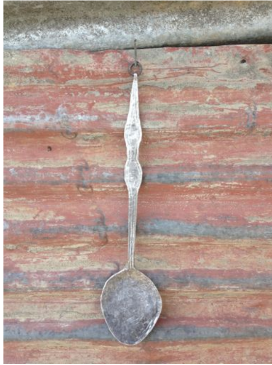
A rice ladle made by Chhering.

Chhering also occasionally makes along , iron rings about 10 cm in diameter. These rings are used for rope-work and rigging. It is an especially interesting process because he seals the gap in the ring with copper, by hammering out a small piece of a belt buckle, inserting this fragment into the gap in the ring, and placing the whole thing in the zora with some sale , or lake salt from Lehdak, which is used when heating copper, silver, and gold.