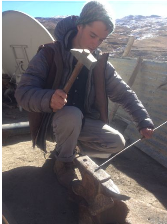
The author in Spiti, India.