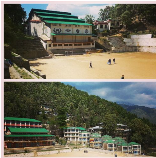
TCV in upper Dharamsala

A typical response came from a 28-year-old woman who learned about the birthing process "from teachers, from books, internet, and these things sometimes I discussed with my friends also. There was no specific reason it wasn't discussed in the family."