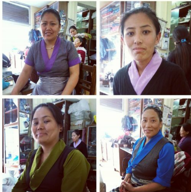
Members of Stitches of Tibet; all four were born at home and chose to birth their own children in Indian hospitals.