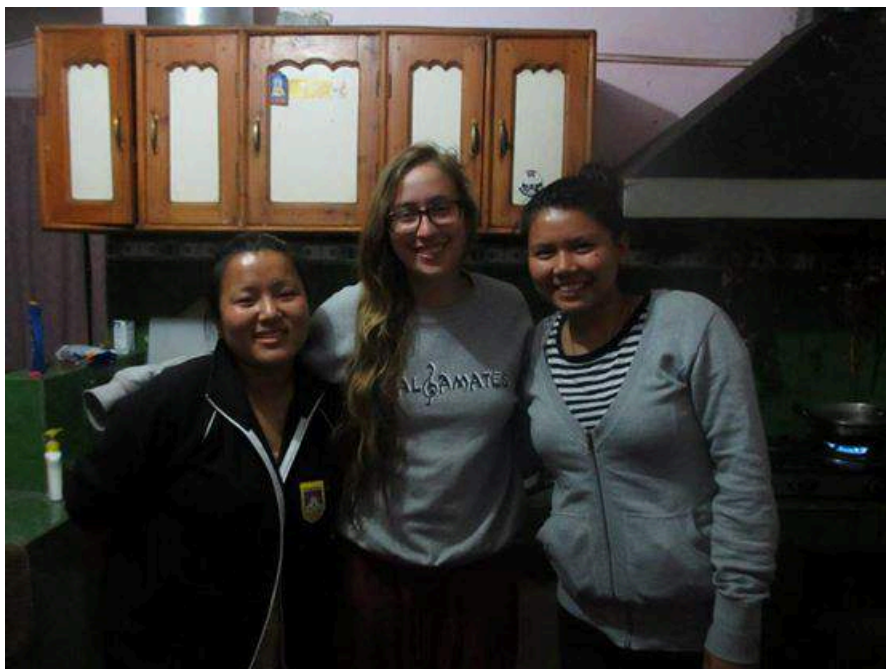
Me and two of my wonderful translators in Pokhara