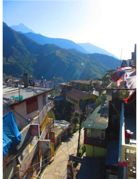
View from the balcony of the old Tibetan Reception Center in McLeod Ganj, Dharamsala