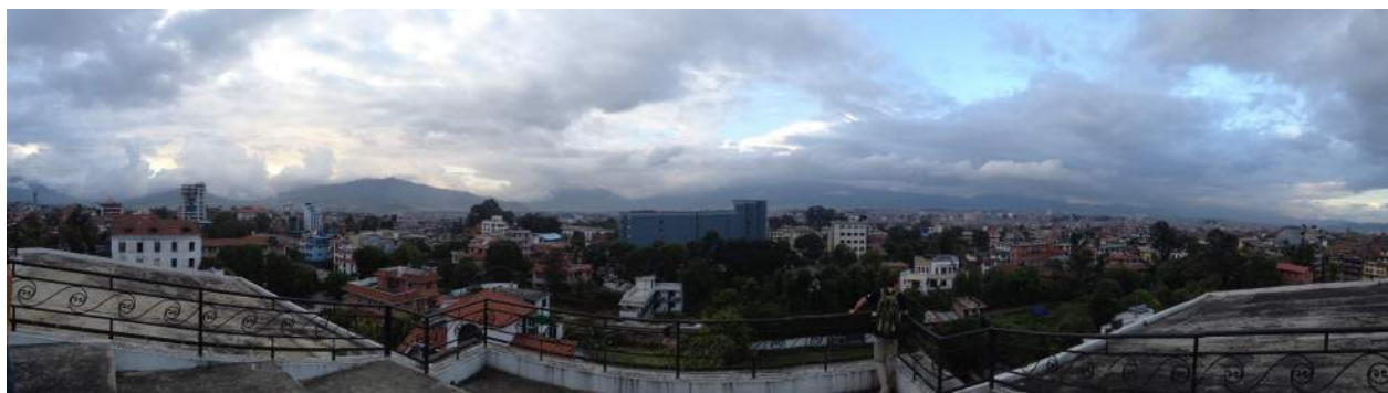
Birds eye view of Kathmandu, Nepal