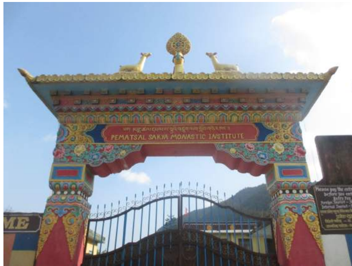
Pematsal Sakya Monastic Institute Gate outside Tashi Palkhiel Tibetan Refugee Camp in Pokhara, Nepal