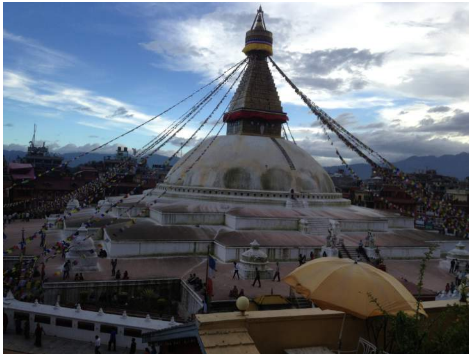
Boudhanath Stupa in Kathmandu, Nepal