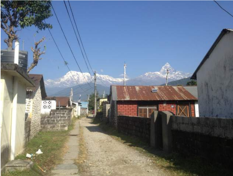
View of Tashi Palkhiel Tibetan Refugee Camp in Pokhara, Nepal

Tibetan Buddhist nuns who had been “imprisoned or tortured for their nonviolent protests of the Chinese occupation of Tibet” for a documentary titled “Satya: A Prayer for the Enemy” (Satya A Prayer for the Enemy). In these ways I did my best to use my time, networking, and financial resources to get the most expansive and diverse narrative I could in order to capture the experience of Tibetans exiled in Nepal and India. That being said, Tibetans are scattered around the world and the conversations I’ve had cannot be generalized or used to homogenize a whole, dynamic, people.