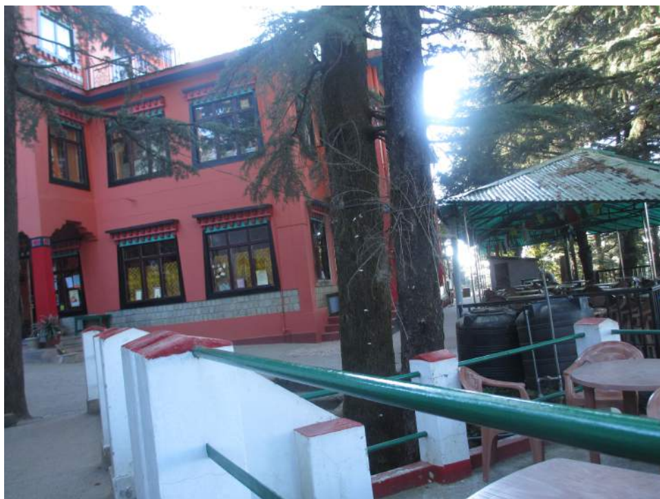
Tushita Meditation Center in McLeod Ganj, Dharamsala where I Explored Tibetan Buddhist Meditational practices on compassion and mindfulness