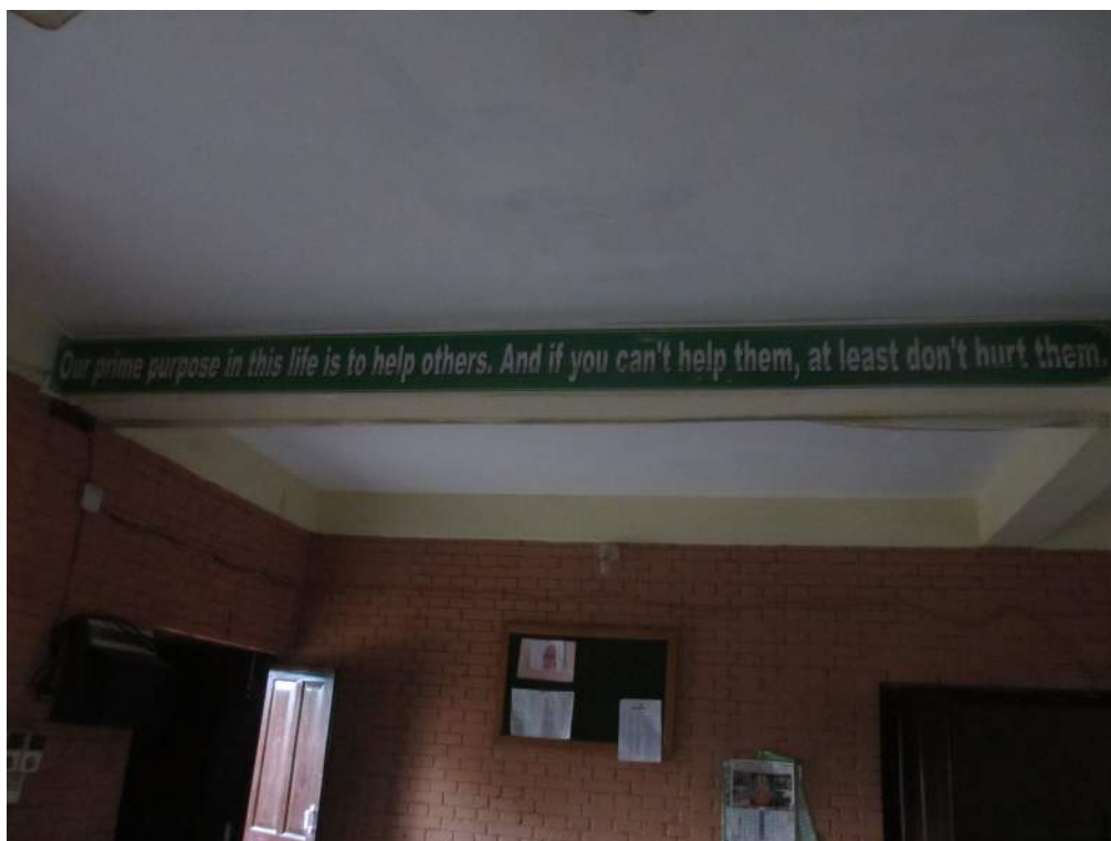
A sign posted in the cafeteria of the children's hostel at Tashi Palkhiel Tibetan Refugee Camp in Pokhara, Nepal