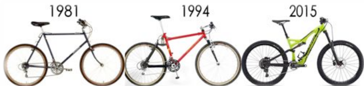
5 Specialized Stumpjumper

Anyway, mountain biking did not come into production or vernacular until the 1970s-80s. Simultaneous off-road tinkering with the road bike occurred in England and California. But Tom Ritchey and Gary Fischer are most frequently credited with bringing the sport to the forefront with their company MountainBikes. In the early 1980s, the first two mass-produced mountain bikes were sold, the Univega Alpina Pro and the Specialized Stumpjumper 4 (a bike that has continued to morph with the times, is still in production, and sits in my garage!).