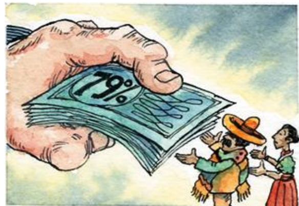
The Economist, 2008

The evolution, expansion, and diversification of the Grameen bank mirrors, to a smaller extent, what has become of the field of microfinance as a whole. What began as small independent microfinance institutions (MFIs) has turned into a wide range of different avenues from small self-help groups in rural India, to multimillion-dollar investment funds in Geneva Switzerland. Money is being funneled into MFIs from a variety of different sources such as USAID and the World Bank as well as non-profit NGOs and for-profit corporations of every shape and size. With the continuously growing interest in the field one would think the impact research must be showing positive results. This is not entirely the case. Over the past eight years or so there has been a major backlash against what some thought would be the solution to poverty. Studies have shown that the actual social impact of microcredit loans is minuscule. In addition, some argue the large for-profit funds are greedy and have shifted the focus from human development to pleasing their investors. The media in particular has been pointing fingers as of late, creating a major turn around in the originally positive public image of microfinance as shown by the illustration to the right. This drawing is supposed to depict the MFI Compartamos Banco