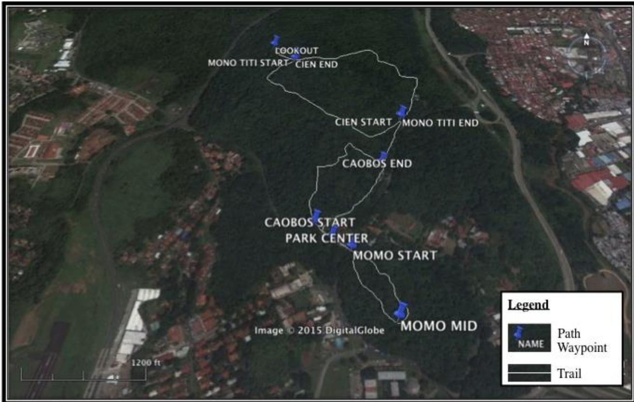
Figure 2 Map of all paths ("Momo," "Caobos," "Cien," and "Mono Titi")