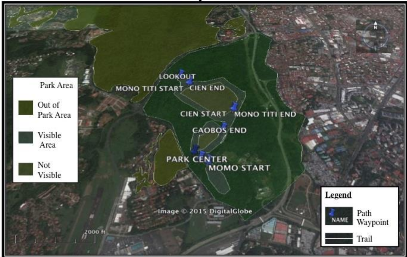
Figure 1 All park map including delineated visible detection area (29m either side of transects)