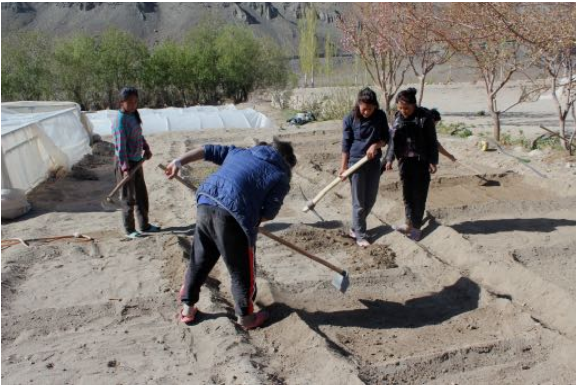
Foundation students during work hour.