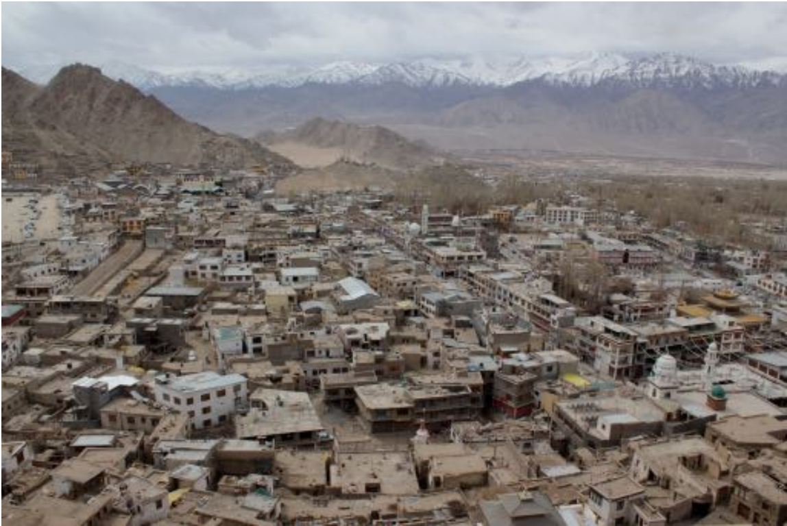
View of Leh from Leh Palace.