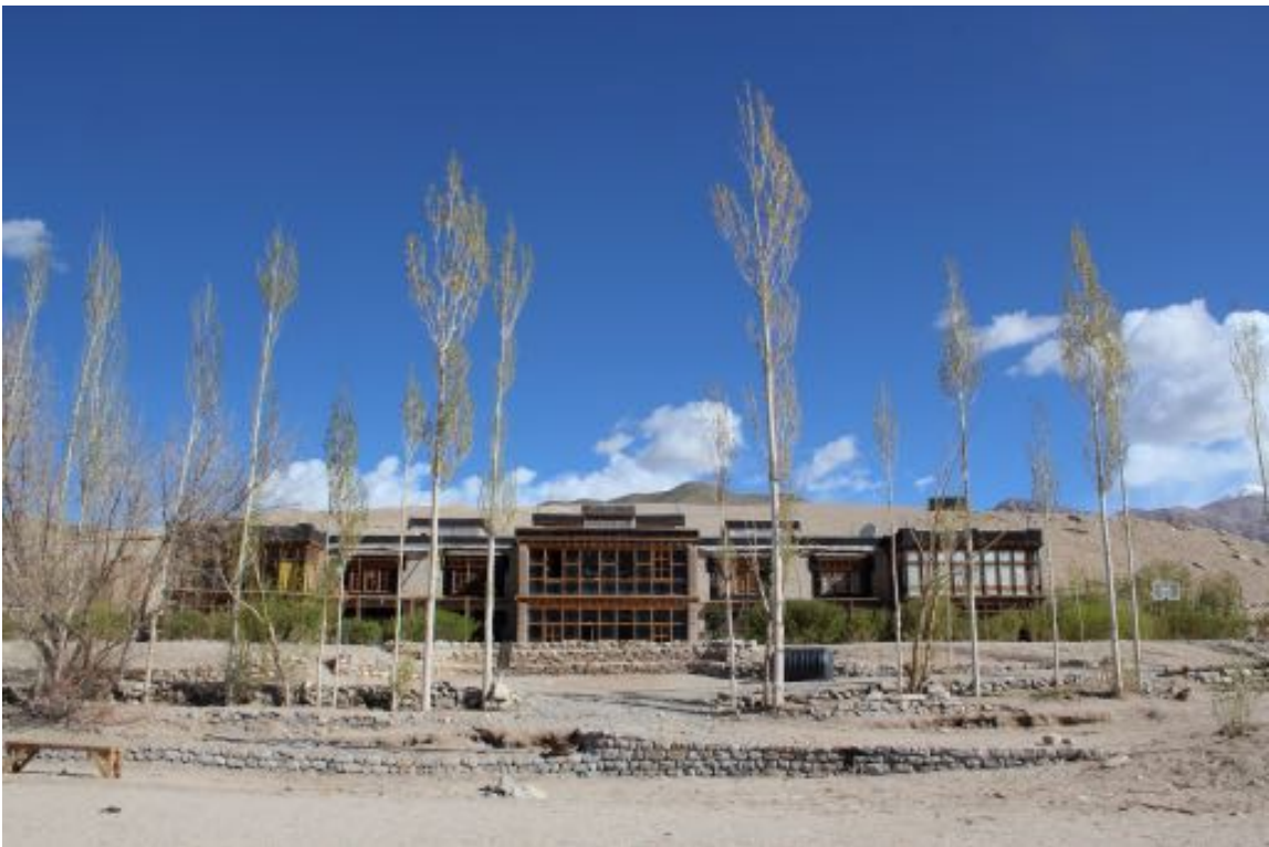
The main building at SECMOL's Phey campus.