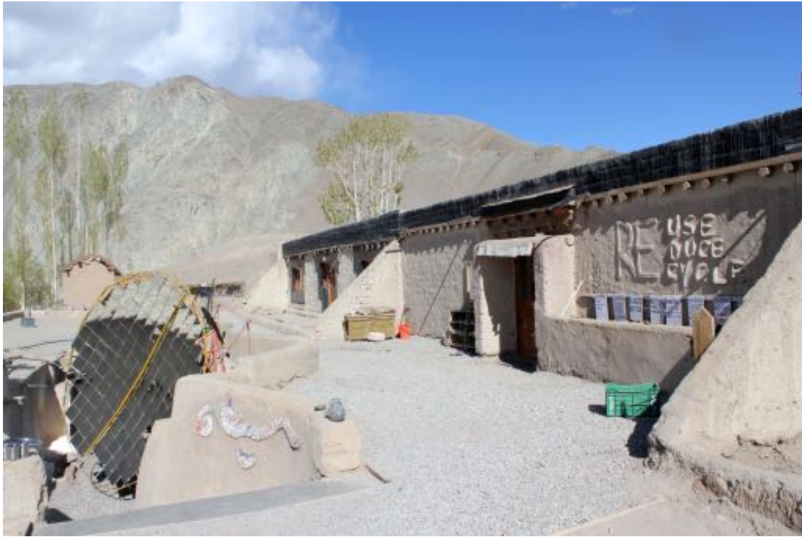
The dining hall at SECMOL's Phey campus.