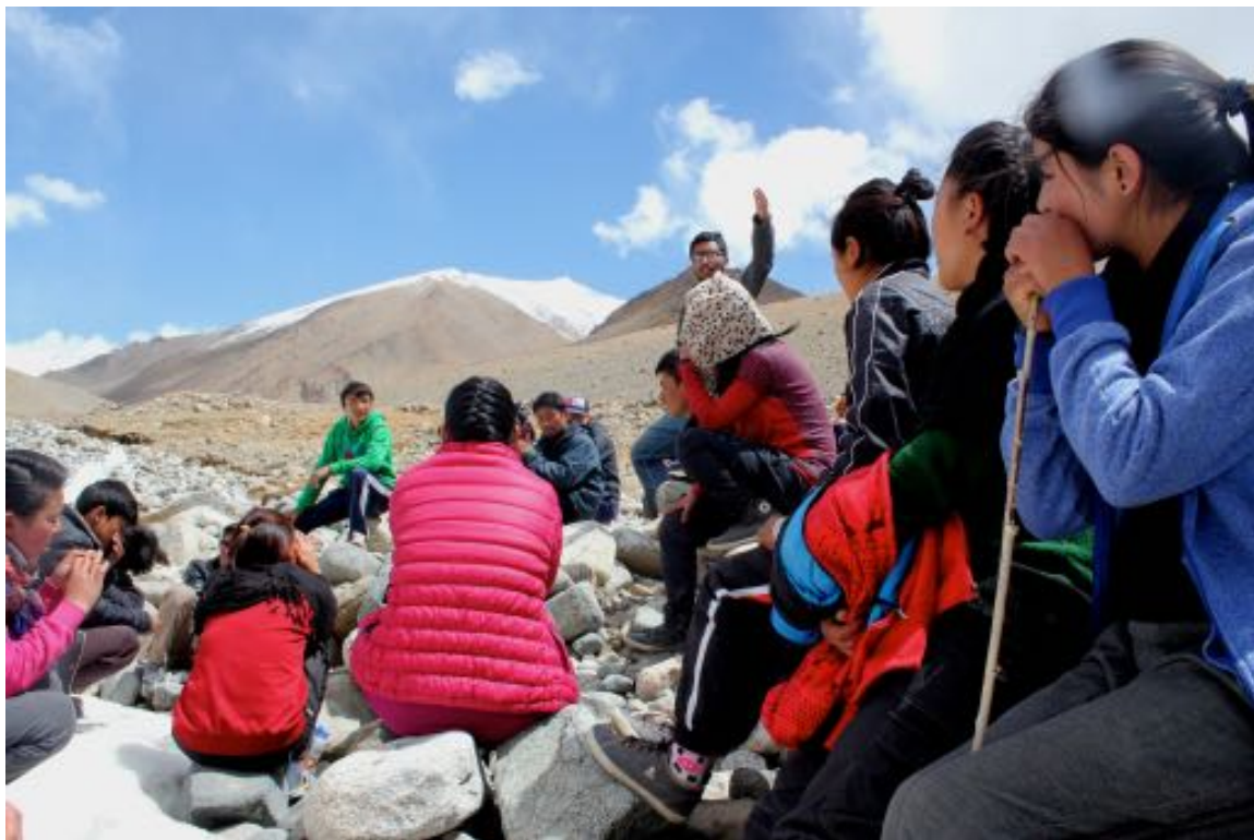
SECMOL students on a field trip to the ice stupas in Phyang.