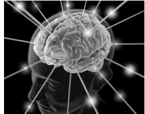
Figure 2 Author Unknown

These wave functions, which store all aspects of consciousness in the form of information, are always present in and around the body. The brain and the body merely function as a relay station receiving part of the overall consciousness and part of our memories in our waking consciousness in the form of measurable and constantly changing electromagnetic fields.