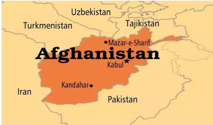
Figure 1: Afghanistan's map with its surrounding countries,

https://qph.fs.quoracdn.net/main-qimg-d86d1dc4e01d1d6b594179bb57556eea