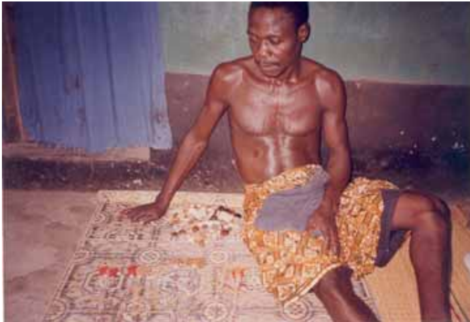
Figure 1: An attendant of the shrine consulting afa. He asks the gods questions and learns the answers through the beads.

The Priest performs his divination through the Afa oracle. Afa is a means to learn things that are unknown from the gods. The Priest sings or chants to invoke the gods, and then, using a bag of charms and four strands of beads, will ask the gods questions and be given answers. To be able to receive the answers one must understand the language of afa, and to do this one must go through extensive training. At the time of observation in November 1998, there were five trainees apprenticing under the Torgbui.