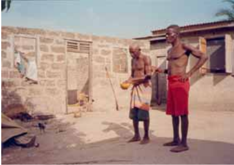
Figure 3: Relatives pouring libation to one of their ancestors.