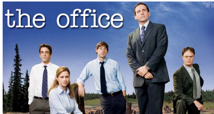
Figure 2 The Office