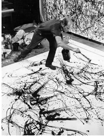
Figure 3 Teaching pragmatics is like painting a Pollock

Jackson Pollock's painting, Autumn Rhythm (number 30) , was the most remarkable expression of what teaching pragmatics means to a teacher of English like me. At first sight, observers only see an intricate group of lines painted without any specific shape or reason, but if we go deeper we will be able to see that every line has a beginning and it does not break until it comes to an end. In the convoluted canvas, the line sometimes shrinks, or sometimes gets thicker. In some other cases the same line stops to allow another on continue, this line becomes successful when finally it arrives to a point where a blissful drop of paint announces the end of its journey.