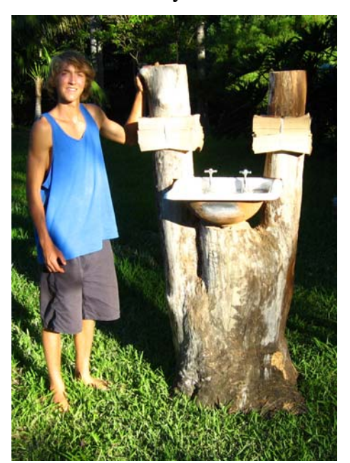
Me with The Carbon Sink (2008)