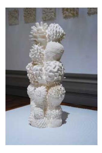
Ken Yonetani - Dead Sea (2008)