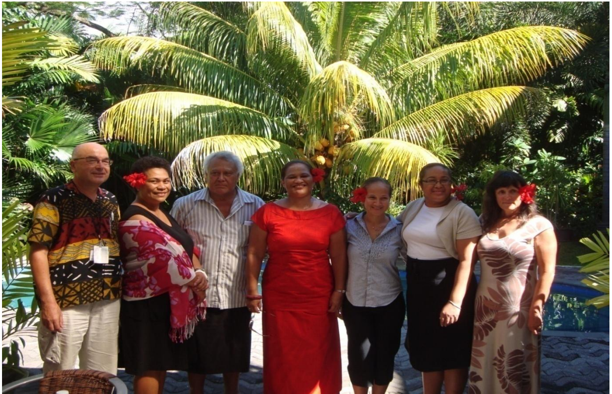
Appendix E: Media representatives preparing for a Skype conference with a PacMAS Consultant. 04 May 2011.