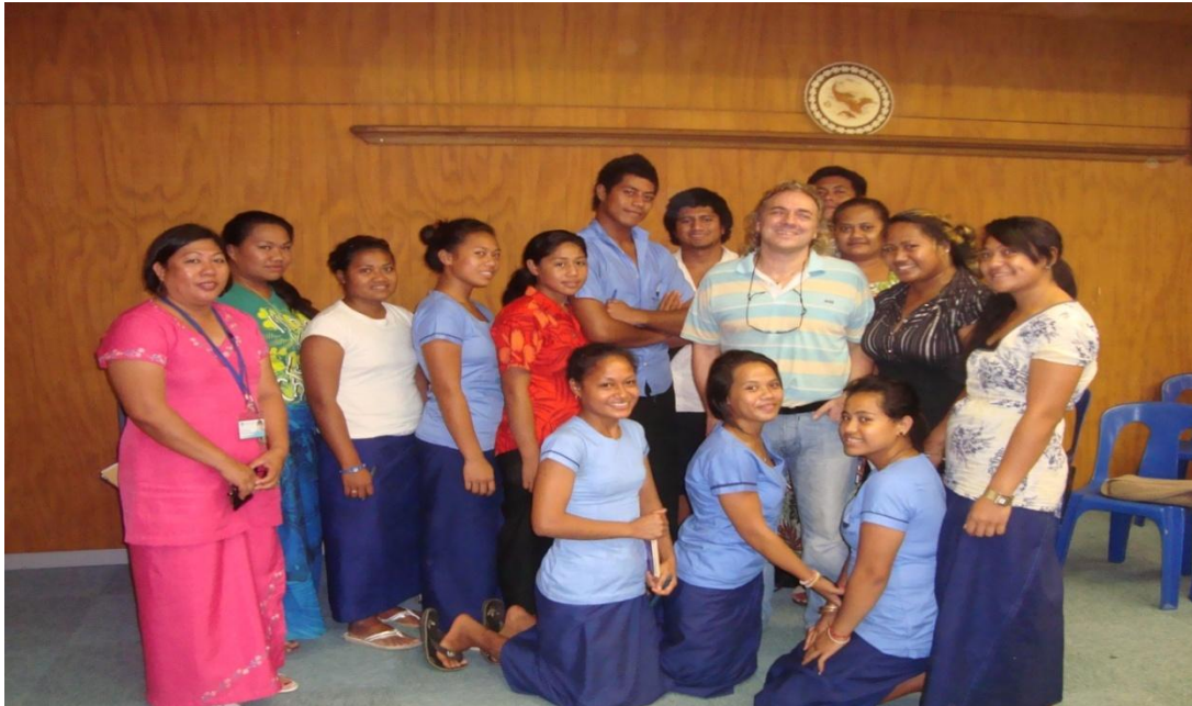
Appendix C: Media representatives at the Inaugural Pacific Media Networks Meeting. 04 May 2011.