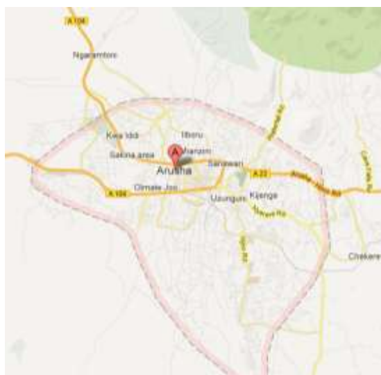
Figure 1. Map of Arusha and its boundary

In Arusha, brokers and dealers are clustered near the Central market ( soko kuu ). Brokers spend most of their time wandering on the streets, exchanging information and trading stones among themselves. They also do business with dealers, whose offices are mostly found in Otu Building and a building sitting in the corner of Metropole Street. A few other dealers are found in other buildings in the same vicinity. Compared to the highly