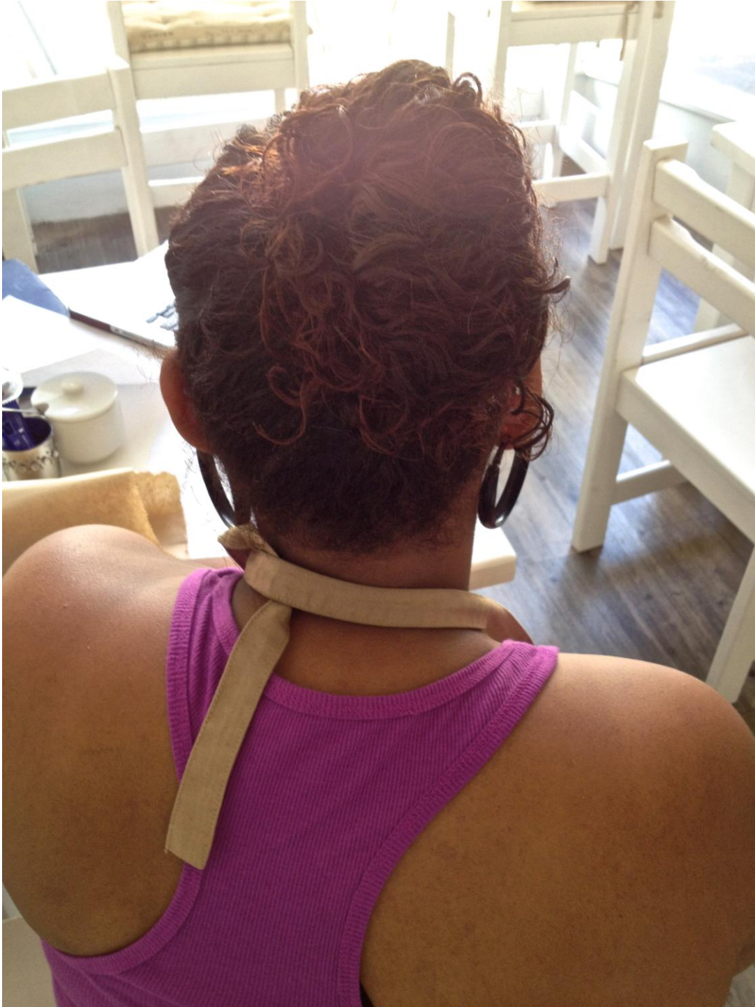
Participant # 7