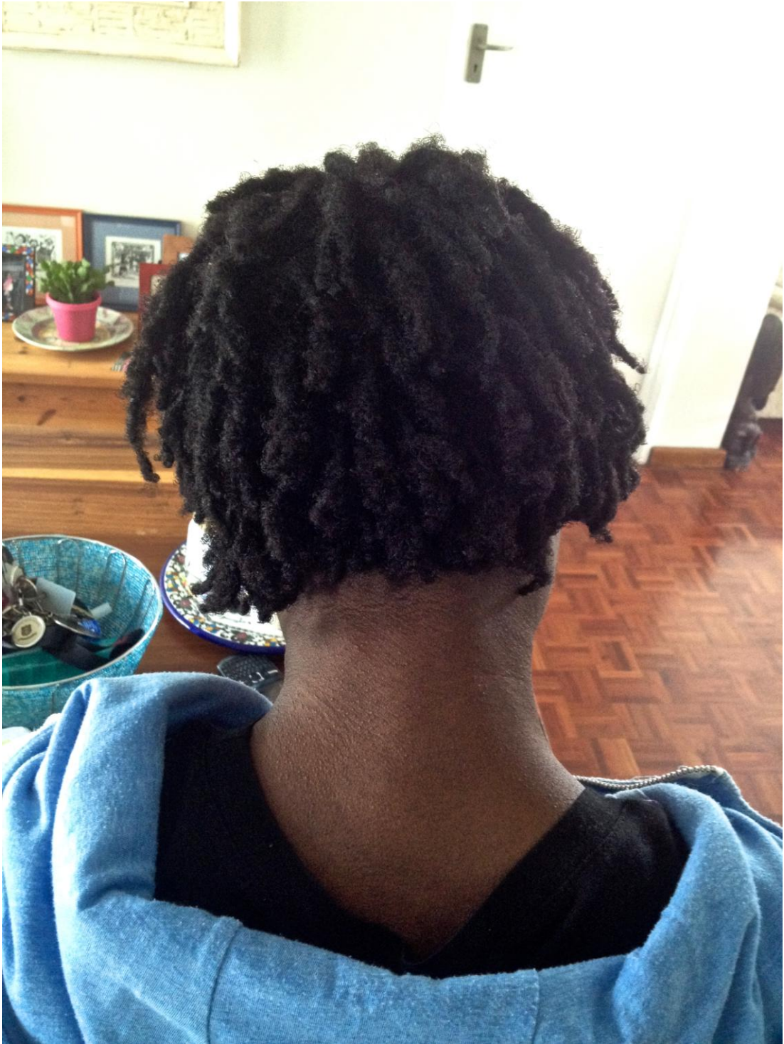
Participant # 5