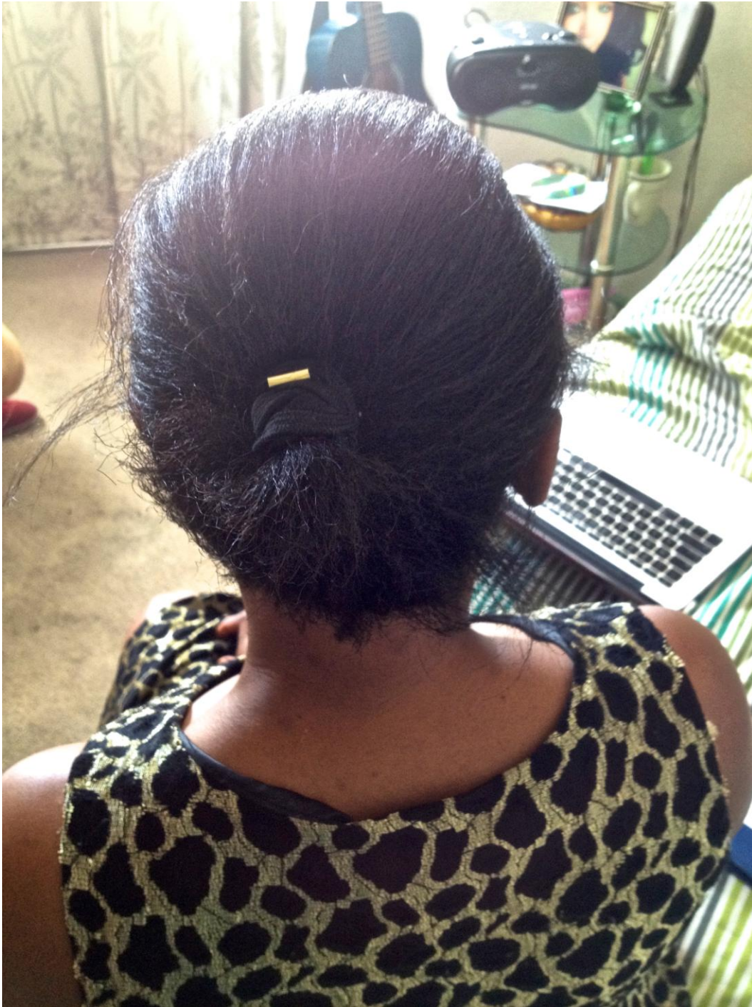
Participant # 4