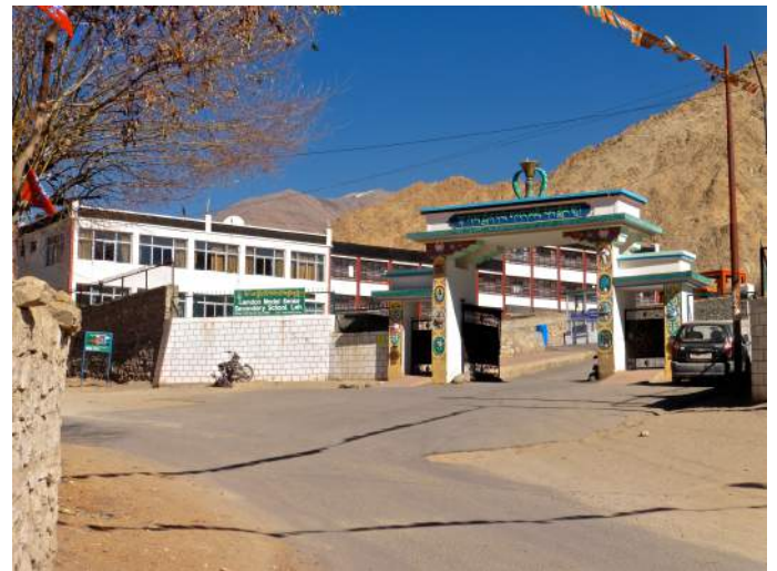
Figure 4 (top left)- Sign outside Lamdon Senior Secondary School. Figure 5 (top right)- Lamdon's Senior Secondary School campus from outside the main gate.