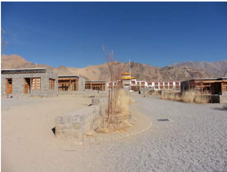
Figure 18 (bottom right)- An image taken outside Druk White Lotus' "infant" boarding quarters.