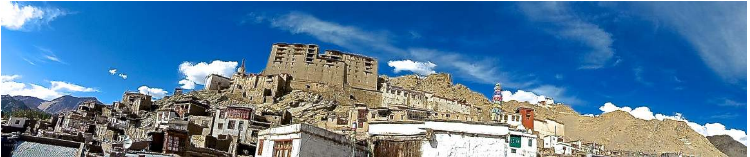
Image of Leh Palace and surrounding buildings (September 2014)

“Submitted in partial fulfillment of the requirements for Nepal: Tibetan Himalayan Peoples, SIT Study Abroad, Fall 2014”