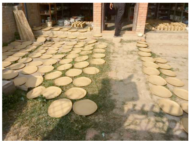
Figure 7: Plates drying in the sun after finishing