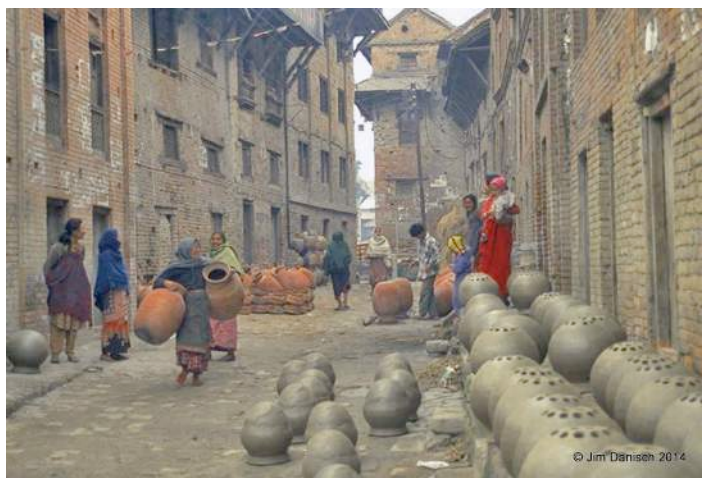
Figure 11: Thimi, 1984. Perforated rakshi distillers to the right, and large rice containers being carried by the woman in the street

Thimi Ceramics products have a simple and modern silhouette and a smooth single color glaze application. One would be hard pressed to see if any trace of traditional Nepali forms remain in the product line at Thimi Ceramics. Everest Pottery on the other hand makes a few products with Buddhist symbols painted on them and their "eyes of Buddha" lamp is very popular at Kathamandu Hotels. However, most of their table ware could be "a staple in any expats kitchen," and looks very similar to western ceramic works. The two workshops ability to make their products modern and attractive to the western eye is perhaps part of their global success.