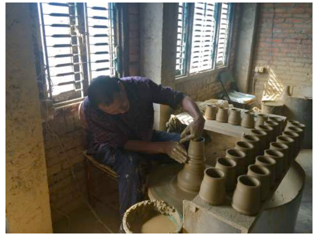
Figure 5: Shiva throwing