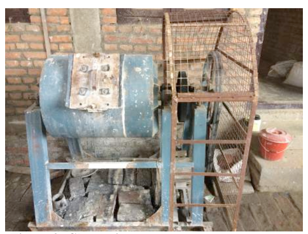
Figure 3: Glaze mixer