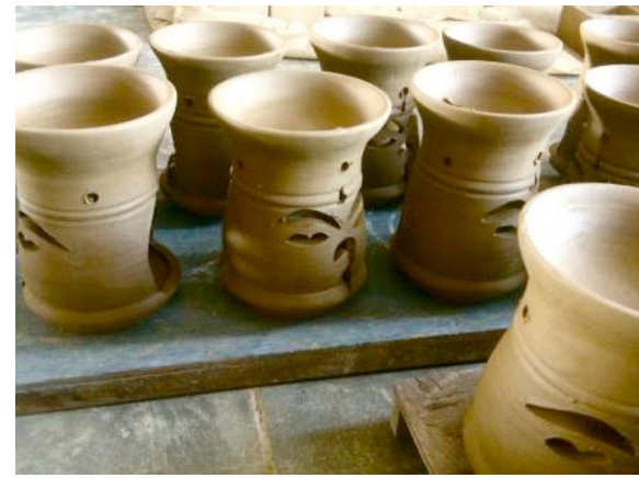
Figure 17: carving detail on "eyes of Buddha" lamp