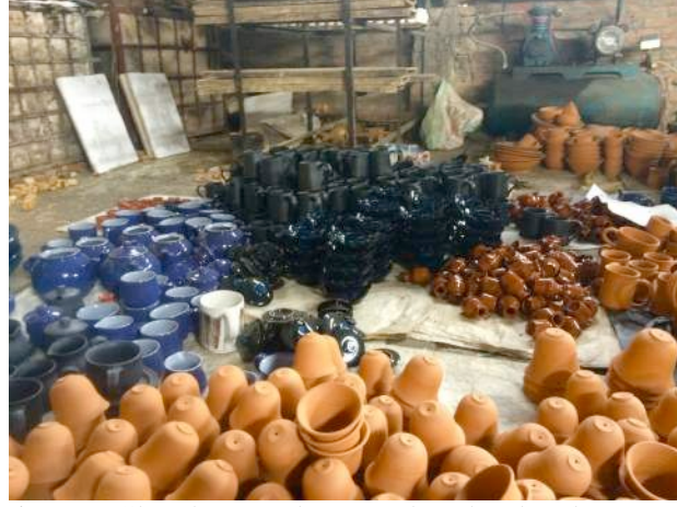
Figure 9: Glazed pots and pots ready to be glazed