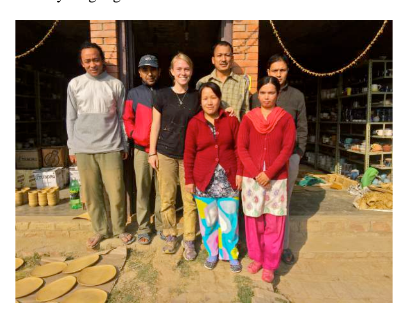
The author with her co-workers at Everest Pottery

I wish that I had been able to more deeply investigate the lives of the women at Everest pottery, and in turn more women in the ceramics community. I think that gathering data in terms of the number of women working in Thimi, and women working in ceramic workshops would be interesting to know. Additionally, the intricacies of the Newari caste system are still hard to understand, and no one I spoke to was able to articulate them to me. Especially today when many rigidities of the caste system appear to be changing, it would be interesting to see what constrains are still on the younger generation.