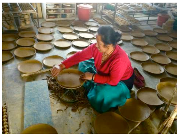
Figure 6: Kamale carving plates