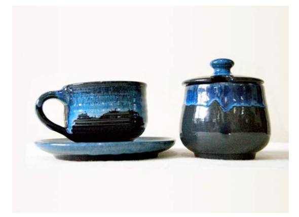
Figure 12: A sample of jars from Thimi Ceramics Pottery