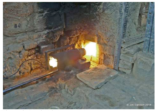
Figure 2: Danisch's kerosene burner at work