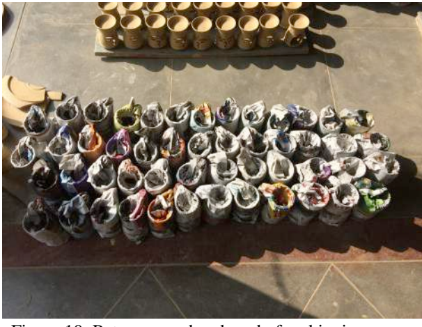
Figure 10: Pots wrapped and ready for shipping