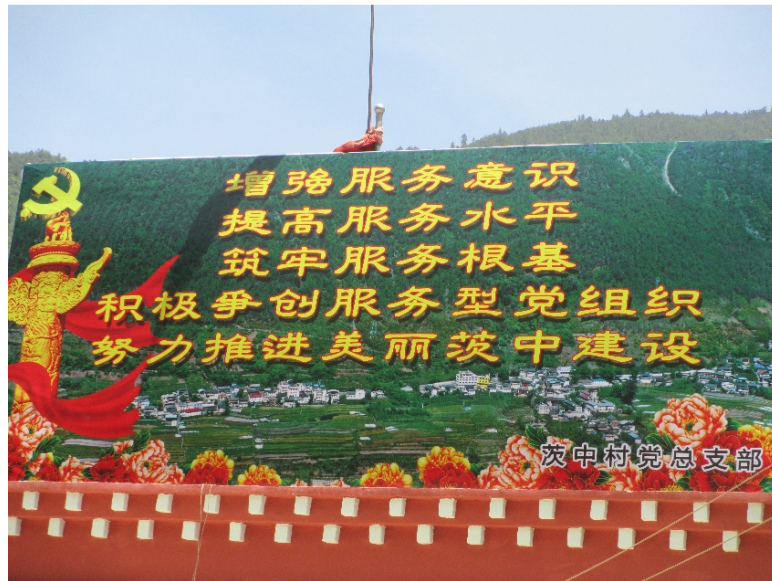
Figure 2: Propaganda billboard above the government building

scoffing at the government's large billboard. However, villagers understand the precariousness of their situation, and active resistance to the policy has been nonexistent.