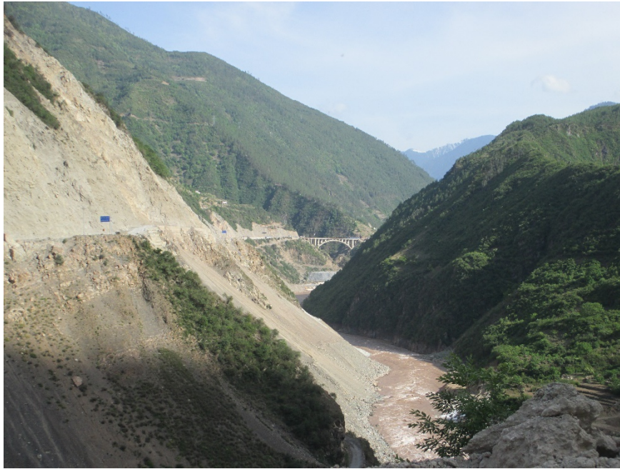
Figure 1: Contrasting mountain faces show the damaging effects of construction

In Cizhong proper, new paved roads are also in the process of being built. Every day that I was in the village, about another ten to fifteen meters worth of cement was laid down and paved. This was often a source of frustration for the villagers as well as myself, as taking long detours through the terraced fields became necessary to avoid stepping in the wet cement. Additionally, the construction made it necessary for all electricity in the village to be shut off during the daylight hours, and would only return at the coming of dusk; at least on most days. On the nights when electricity did not return, which occurred about once every week during my research period, only those with gas powered generators would have power. This consisted of only a small minority of families in the area, as well as government officials. The rest would be left with flashlights and candles for the night.